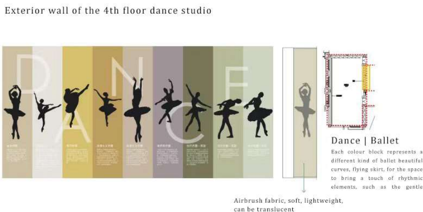
Figure 4. Dance-themed classroom outer wall effect

enrich the wall level and add a sense of interactivity. For the design of the dance outdoor wall, the dynamic silhouettes of ballet dancers, beautiful curves, fluttering skirts, bringing a touch of rhythmic elements to the space. Such a gentle colour combination creates a romantic and elegant atmosphere. When teachers and students walk in the corridor, the dancers on the wall will dance and interact with them through human sensors.