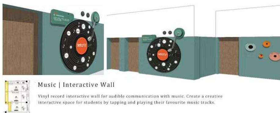
Figure 1. Music themed classroom exterior wall rendering