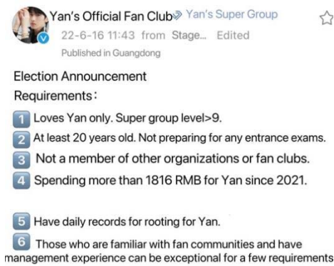
Figure 1. Yan's fan club recruitment announcement

support group means becoming a leader among fans, a symbol of ability and loyalty.