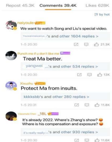
Figure 3. Fans' comments under a company's post

The analysis of these two approaches shows that the company does not care about its fans, and that this "not caring" attitude is due in large part to the high stickiness of fans that is unique to nurturing idols. As mentioned earlier, unlike other fans, a large proportion of nurturing idols' fans have been with the idol since idols were children unknown to anyone, watching them grow physically and mentally. Even those who become fans after their idols have grown up and become famous can still feel the feeling of "nurturing" by watching the company's full record of their idols' growth. As a result, nurturing fans have one of the most stable and long-lasting relationships among human beings, namely, parental