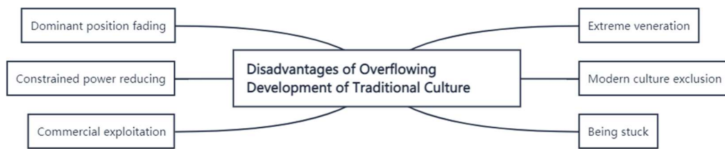
Figure 1. Disadvantages of Overflowing Development of Traditional Culture

uncontrolled development of traditional culture. This extreme perception renders traditional culture in a modern society in an awkward state of "being stuck," unable to fully play its positive role or avoid misuse and abuse.