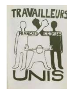
Figure 3. 1968 "May Storm" poster

For example, we can use text analysis and semiotics to study the posters of the May Storm movement in France in 1968. First, we can analyze and explore the sensory elements of the posters from the visual text of the May Storm posters, and we can see the ideology and struggle presented in the images. We can carefully understand the form of the posters, the production style of the posters, and the viewing context, and the influence of the printmaking techniques used in the posters in a specific context on their dissemination, and we can see the posters' practice of personification rhetoric. Then, through the discussion of rhetoric, we can analyze the personification techniques in the posters and explore the cohesion mechanism of symbols in the images, thus providing a perspective for viewing the May Storm posters (as shown in Figure 3). [3]