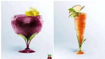
Figure 2. Posters designed using pictograms

Therefore, the functions and effects of literary rhetoric in poster graphic design include making posters more vivid, concise, easy to understand, and impressive. Designers can select the entry point of association through the similarities between two objects, correspond the rules of literary rhetoric to the selection of graphic elements and the expression of graphic forms, and realize the practical application of poster graphics in terms of associative power.