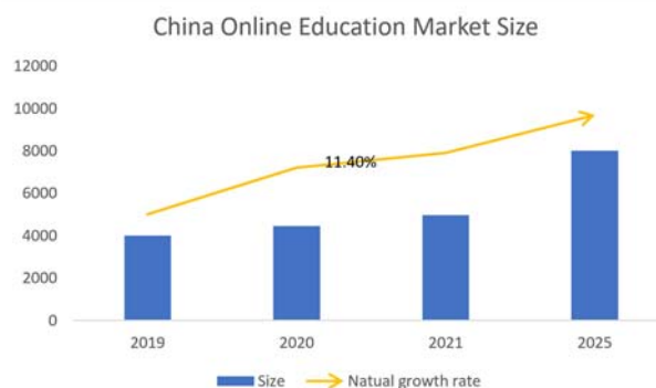
Figure 1. China's online education market size and its growth rate