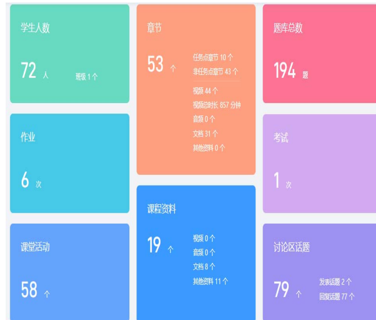
Figure 1. The basic data of the course

The basic data of the course is shown in Figure 1.