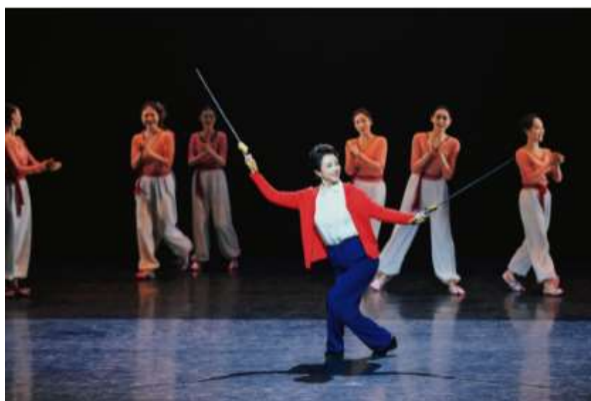
Figure 2. A still of the Original Musical Theater Guan Su Shuang

Colleges and universities organize students to create and perform original musicals, provide a stage for students to show their creativity, and vigorously promote the construction of campus culture. This form of practice requires students to have a deep understanding of the creative elements of a musical, including script conception, music creation, choreography, etc., combining creativity with professional knowledge (Liu, 2024). Yunnan Arts College's original musical 'Guan Sushang' (created by the School of Music) blends Peking Opera with musical theater. It offers a timeless perspective on Guan Sushang's granddaughter, Chu Chu. The production integrates Yunnan's local cultural elements, showcasing the institution's achievements in musical theater creation and performance. During the process, students blend local culture with contemporary musical theater forms. This fosters students' understanding and appreciation of local culture and serves as a conduit for its transmission and evolution through stage performances. The original musical theater is important for the exchange of ideas between campus and local culture. This improves the cultural scene on campus and helps students to be more confident and creative.