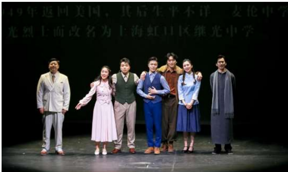
Figure 3. A Still from the Musical Theater Spring Shanghai 1949

historical scenes on stage. Through lighting, props and set decoration, an atmosphere is created that matches the plot and enhances the audience's sense of immersion. This approach integrates diverse academic disciplines, facilitating students' professional expertise in musical creation and collaborative and creative abilities. It offers a valuable example of integrating theoretical concepts with practical applications in college music education.