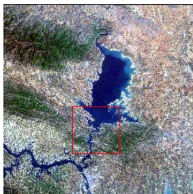
Figure 1. Pre-processed image in the study area

In this paper, part of the image of Lanzhou City was captured for analysis, and the image in the study area was obtained by atmospheric radiometric correction, geometric correction and image segmentation, as shown in Figure 1.