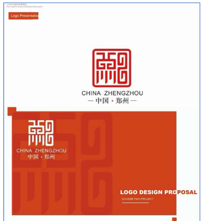
Figure 3. City Image Logo design3

The third design is inspired by the iconic Zhengzhou noodle dish, which holds deep cultural significance in the region. As a beloved local delicacy, the noodle is a symbol of the city's rich food heritage, representing the warmth, hospitality, and everyday life of its people. The shape of the noodle, with its long, flowing curves, was creatively used to form a fluid, curvilinear design that not only evokes the culinary tradition but also integrates elements of the city's architectural features. The swirling, dynamic lines of the noodle are stylized to create a sleek and modern logo, which reflects the balance between tradition and contemporary innovation in Zhengzhou. By incorporating the noodle's shape into the design, the logo draws on the city's culinary culture while infusing it with a sense of movement and modernity. The result is a distinctive and memorable visual symbol that connects the city's rich heritage to its evolving identity. The logo's fluidity mirrors the constant change and growth of Zhengzhou, while still honoring the simplicity and authenticity that the noodle dish embodies. This proposal successfully combines cultural symbolism with contemporary design elements, making it a powerful representation of Zhengzhou's unique character and its dynamic future.