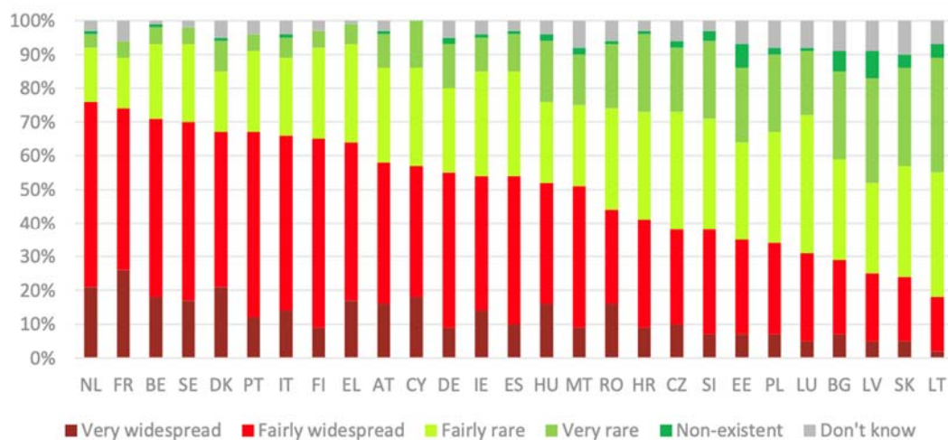
Source: Eurobarometer Discrimination in the EU, September 2019.

Back in 2019, through an EU-wide Eurobarometer survey (pictured above), it was found that more than half of social groups believe that racial or ethnic discrimination is widespread in their country. Even though the EU prohibits and condemns racial discrimination, it still exists. This became particularly evident during the Covid-19 pandemic.