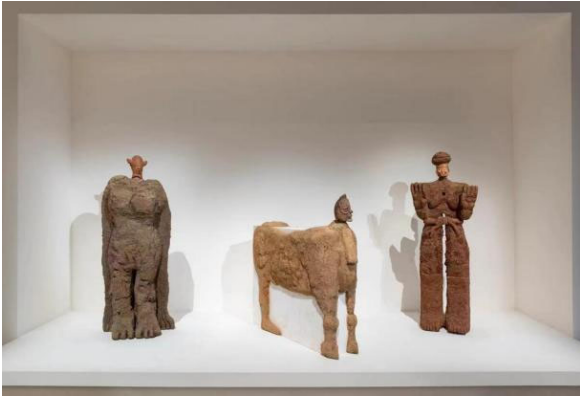
Figure 3. Works by Ali Cherri in The Milk of Dreams , 59th Venice Biennale, 2022. [14]

The early years of the Reagan administration favored, it seems, a more sophisticated stratagem which emphasizes the appropriation and reworking of a common visual vocabulary. The language of the art catered to the embrace of consumption and “happiness”. This conclusion may be detected in Warhol’s repetitive use of Da Vinci’s Last Supper , or Sherrie Levine’s rephotographings and parody of famous photographs. Needless to say, these historical images were unavoidably filled both with their own original historical insight and their utility to the present, and were made over into commentary alongside meaning circulation. This means “they were an implicit critique of more normative forms of aesthetic originality, which sought instead to produce itself—falsely—as self-generated.”[15] Simone Leigh’s works undoubtedly prove the point that artistic victory belongs to the implications of the American political correctness, both in identity and connection to social issues. Some artworks are here designed for those who are forgotten in art history. Repetition of concerns aforementioned in display, the artists and artworks at the Venice Biennale this year gained unique status. This phenomena represents the triumph of the historical motive as discussed here—the impact of Culture Wars and the art.