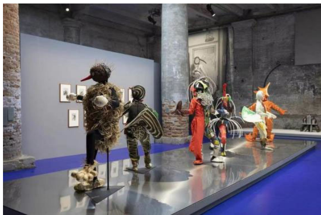
Figure 2. Seduction of the Cyborg, in The Milk of Dreams, 59th Venice Biennale, 2022. [11]

The main show this year, organized by Cecilia Alemani, an Italian-born New Yorker, is absolutely a tightly argued and successful exhibition, and its intentions are obvious enough to be in the center of campaign and discussion. “Her feminist, surrealist and ecological approach has produced a coherent and challenging show, whose optimistic vision of emancipation through imagination feels very rare nowadays.”[10] The native element, respect of traditions, as well as insight on a future eroded with cyborgs and data spill over at the scene. It's difficult to unveil whether the meaning is likely to be well received by the masses. Plus, the fact is that an overwhelming majority of the participants are women, and the key themes are surrealism, cyborgism, animal and plant life.[12] However, after observing the themes and artworks in detail, it appears timely to trace the route of the debate from a few decades ago.