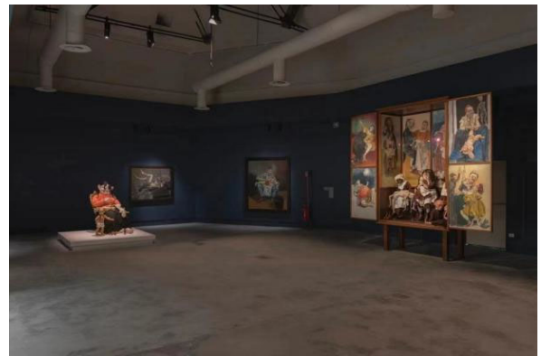
Figure 4. Works by Paula Rego in The Milk of Dreams , 59th Venice Biennale, 2022. [18]

The attention to secrecy, naturalism and aboriginal culture constitutes a majority of the artworks on display, which is one of the byproducts of the Culture Wars and confusing thoughts in art making since the 1980s. The metaphysics for the base of this event has rotted and degraded into chaos of post-contemporary context, or a situation we cannot define anymore. Are human beings supposed to turn to their own timid imagination, where flocks of groups yell for support that is over corrected by the leftists and advocates of the radicals? What is the right way for humanity? Nevertheless, it may be pessimistic to judge the reality in the art world without heading back to the near future.