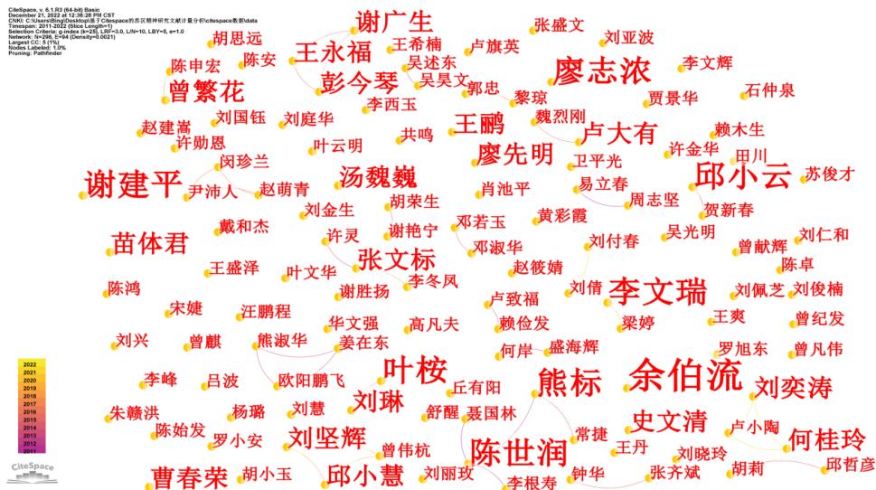
Figure 2. Distribution of authors in the field of spiritual research in the Soviet area (2011-2022)