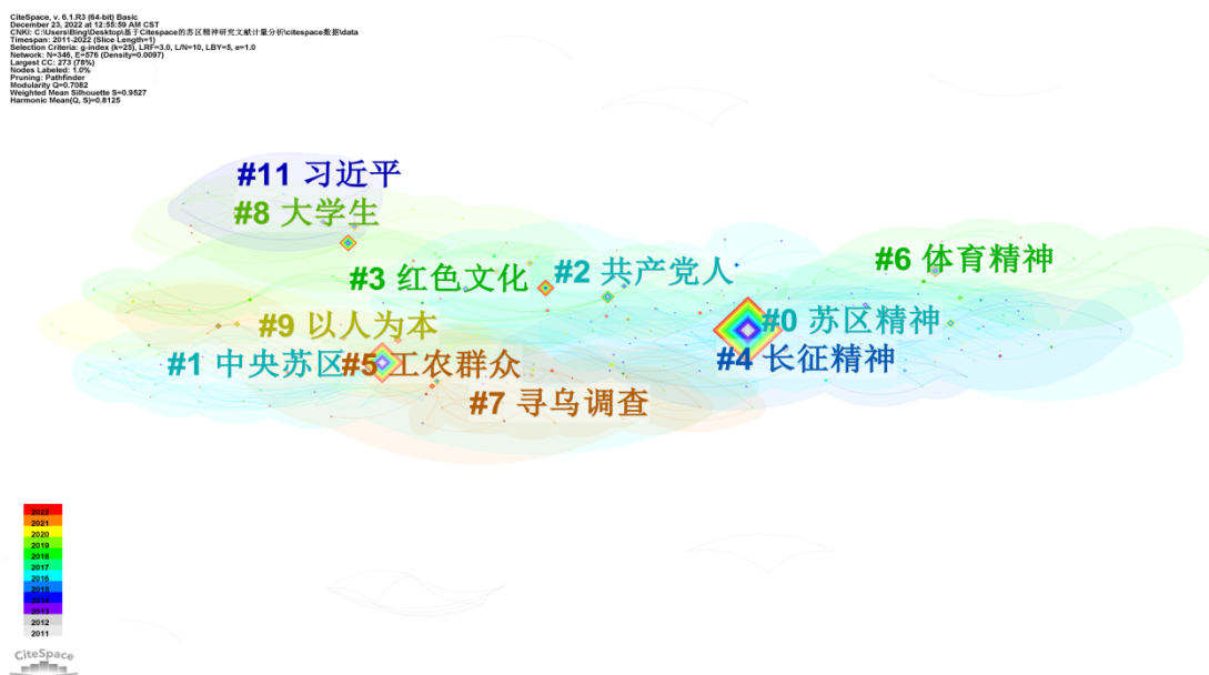
Figure 4. Cluster analysis map of key words of spiritual research in Soviet area

greater than 0.5 means clustering is reasonable, S value greater than 0.7 means clustering is convincing. The Q value of the cluster map of this study is 0.71 and the S value is 0.95, which shows that the clustering of keywords in the field of spiritual research in the Soviet area is reliable and has a certain reference significance. At the same time, each cluster represents a different color block, and the larger the proportion area of the color block, the more keywords the cluster contains. And the overlapping color blocks, indicating that there are cross-similarities in the research part of the cluster. Therefore, based on the cluster map analysis of keywords, the 11 clusters in the map are summarized and sorted out, and the research topics related to the spirit of the Soviet area can be divided into three levels.