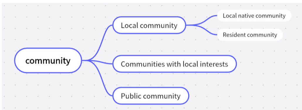
Figure 1. Schematic diagram of community subject

The third is the public. For the public, the social welfare of the heritage should be highlighted, and a mechanism should be formed to allow more citizens to visit the cultural heritage related to the Three Kingdoms, thereby generating a sense of national pride. At the same time, it is necessary to effectively maintain the cultural heritage of the Three Kingdoms and form a sustainable use of relevant cultural heritage, so that citizens from generation to generation can enter the heritage scenic spot and enjoy the heritage resources that are legally owned by them.