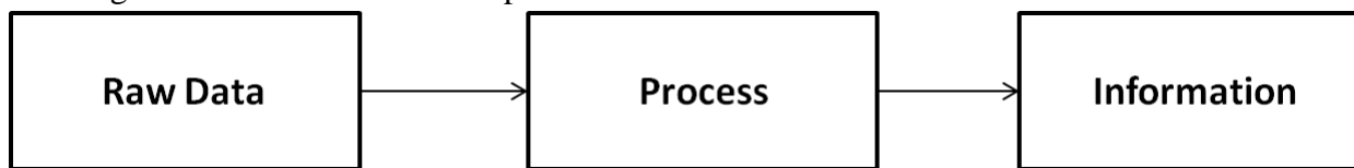
Figure2. The process of Data processing

Data is raw unprocessed facts and figures that have no context or purposeful meaning and information is processed data that has meaning and is presented in a context According to Hardcastle Data is a raw fact and can take the form of a number or statement such as a date or a measurement. Information is generated through the transformation of data. According to OBrien & Marakas Information as data that have been converted into a meaningful and useful context for specific end users.