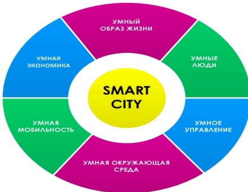
Figure 1. 6 main features of the European model of city infrastructure rating

Environmental indicators in determining the rating of infrastructure of modern cities European smart cities. According to this model, a Smart City is a city with high performance in 6 main characteristics and internal indicators.