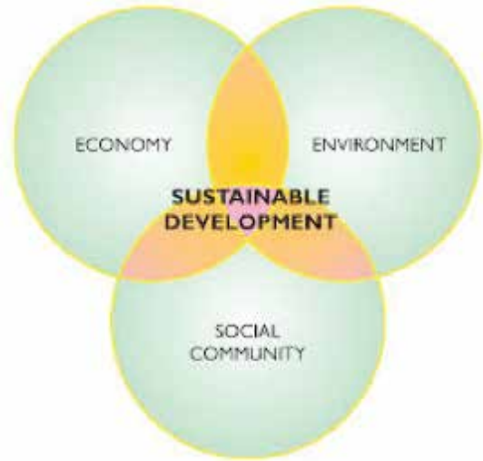
Figure 1. The concept of Sustainable development.

A very simple survey carried out by the WWI has in fact shown that the frequency of use of the word “Sustainable” in US English text (as a percentage of words, by year) has constantly been increasing over the past 50 years. Projections (and here comes the humor) show that, if the trend remains unchanged, in 2109, all the sentences will be “just the word Sustainable”, repeated over and over again. The risk of “green washing” for businesses and governments is in other words concrete and increasing, as it is the confusion in international supply chains, where we are witnessing a rapid increase of specific requirements on the subject, included in contracts, special purchase specifications, ethical codes and other documents of contractual relevance. In the following paragraphs the specificities of the leather supply chain will be analyzed under this perspective.