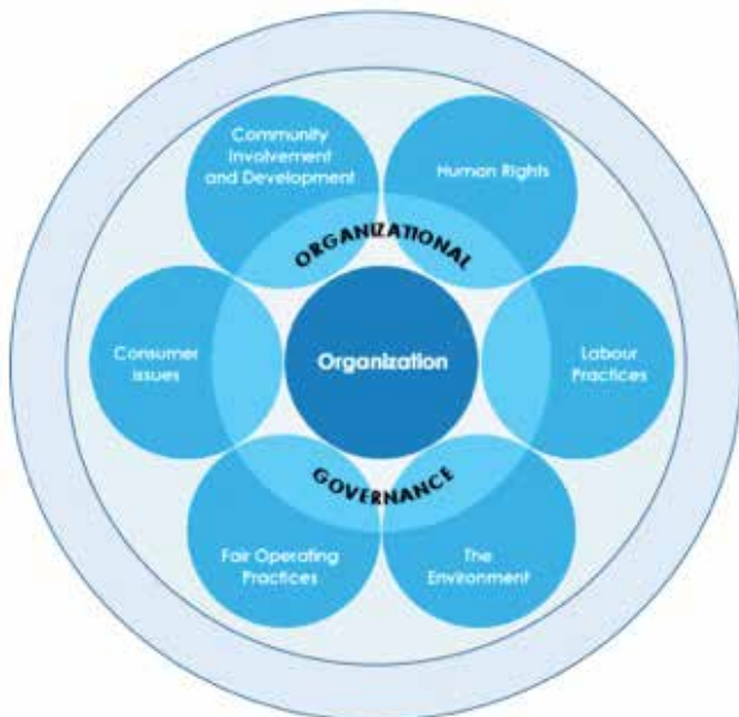
Figure 4. ISO 26000 “Generic” Requirements.

LEATHER TRACEABILITY can be defined as “ the ability to verify the history of leather (and raw hides), by means of documented recorded identification ”. Our research shown an increasing trend by brands and retailers in requiring traceability from the finished product up to the farm(s) where animals have been raised. The most important reason for this is again the avoidance of risks related to unsustainable practices in animal rearing, such as for example deforestation or animal bad living conditions.