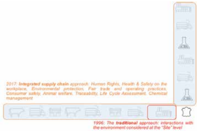
Figure 3. Evolution of Requirements on Sustainability in the leather supply chain.