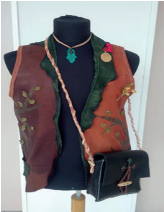
Figure 6. Use of decorative linden flower as collar decoration (by Eser Eke Bayramoglu)