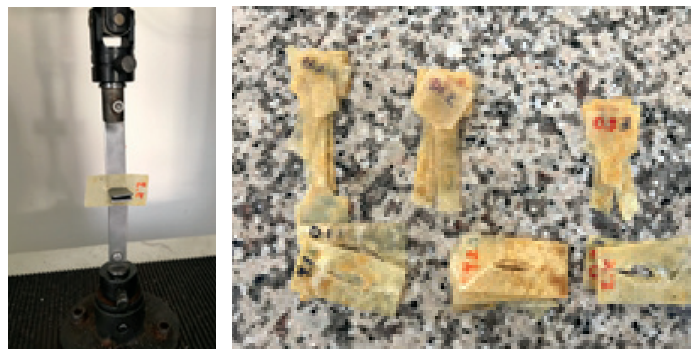
Figure 4. Determination of tear load

Some tests were applied to the parchment skins that were produced. These tests were: Determination of thickness, 7 Determination of tensile strength and elongation, 8 Determination of tear load - Part 2: (Double edge tear), 9 Leather - of distension and strength of grain, 10 Color fastness to water spotting. 11