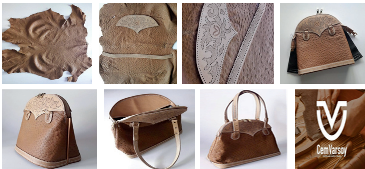
Figure 1. Production of bags from ostrich skin with the collaboration of Eser Eke Bayramoğlu and Cem Varsoy 5

However, it was observed that the skins were cut into pieces and peeled off in turkey slaughterhouses. For this reason, the cut parts