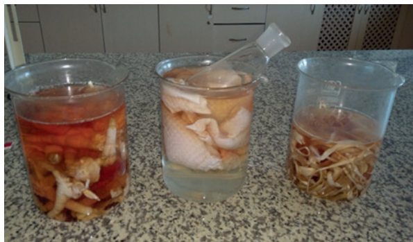
Figure 2. Turkey skins preliminary trials

Turkey skins were obtained from Pınar meat company. Turkey skins were obtained from Canadian origin white feathered turkeys weighing about 5-6 kg after slaughter. In general, it was observed that the skins were cut into pieces rather than as a whole, and there