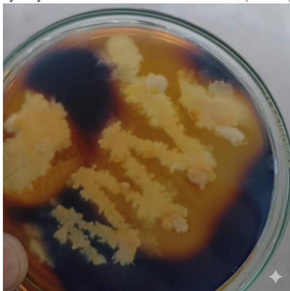
Fig. 1. Starch hydrolysis test

When the starch plates were flooded with a 1% iodine solution to test for amylase activity, a clear zone surrounding amylase-producing bacteria was seen in 31 isolates. Amylolytic activity was determined by evaluating the zone of clearance (Fig.1). Initially, the 15 bacterial strains were assessed according to their maximum hydrolysis zone. They showed a good zone of hydrolysis when flooded with iodine solution (Table 2).