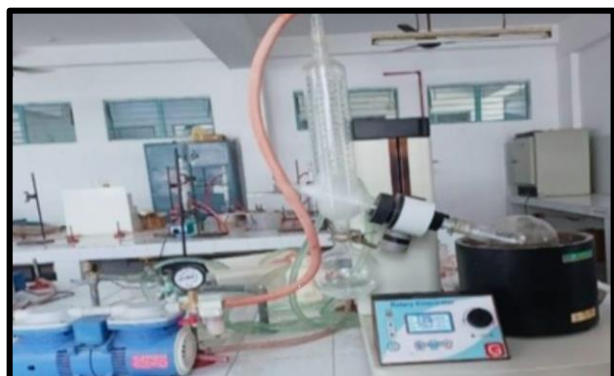
Fig. 4. Recovery of ethanol