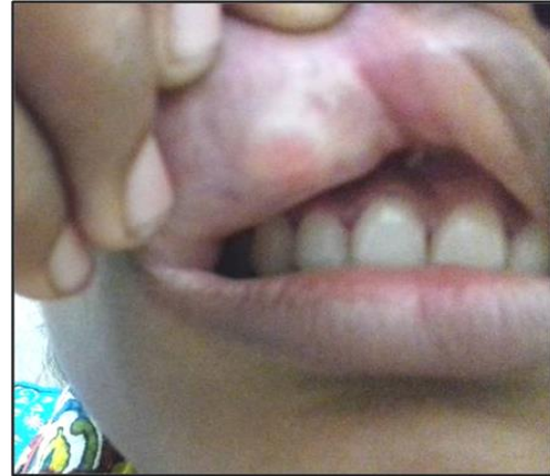
Figure 1: Intraoral clinical photograph