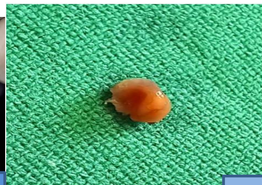
Fig (E) : Excision of the lesion using electrocautery ( Bonart ART-E1 Electrosurgery Unit, with a Coagulant setting and with mucocele grabbed by HDT Tissue forceps Adson 1x2 12cm [TP42] used . Fig (F) : grossing it is a single bit tissue approx 0.5x0.7cm in size ovoid in shape reddish brown in colour with smooth in surface texture