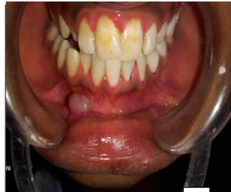
[A&B] Solitary, well-circumscribed, oval-shaped swelling largest diameter with smooth, shiny surface and having a slightly bluish hue present in relation to the lower right labial mucosa.