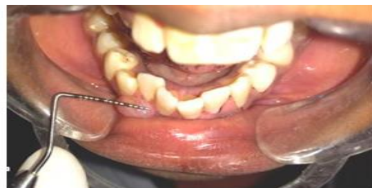
Fig C&D measurement was done by using University of north carolina (UNC 15) probe (LX 5x7mm)