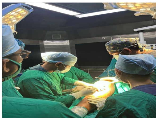
Figure 2: Intraoperative Photograph