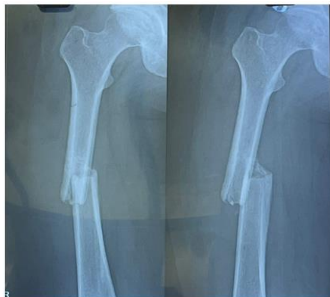
Figures 1: Preoperative X-ray (AP/Lateral Right Femur)

Written informed consent was obtained for participation and publication of this case report and associated clinical images