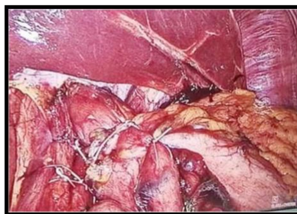
Fig. 2 Total fundoplication

Bougies were used in all patients. All procedures were performed by only one surgeon.