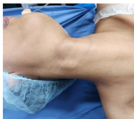
Fig:1 Preoperative presentation

of the C5 vertebral body and appeared isointense on T1 weighted imaging, isointense to hypotense on T2 weighted imaging, with no evidence of diffusion or restriction, features likely suggestive of branchial cleft cyst. The results of FNAC revealed characteristics of a branchial cleft cyst. These observations led to the patient being operated on, and the cyst removed was examined. The gross discovery revealed that the tissue was 3 cm by 3 cm in size and that the excised sample was primarily brownish in colour. The cystic cavity of the specimen included mucoid material, and the cyst wall was quite thick and covered in papillary projections.