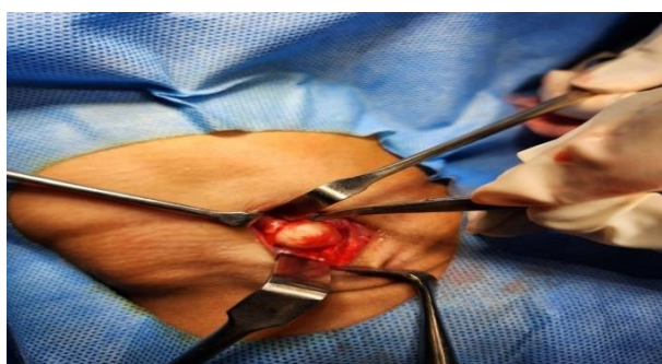
Fig 2b: Intraoperative excision of the branchial cleft cyst