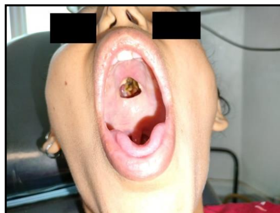
Figure- 3) Palatal Perforation