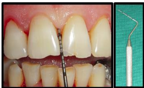
Fig 3. Clinical measurement of Papilla Height and Bone Crest-Contact Point on RVG.

Prior to the scheduled periodontal surgery, after local anaesthesia, bone sounding was done to record the deepest depth at which the probe met strong resistance from the top of the papilla (PH) and from the contact point between the teeth (BCCP).