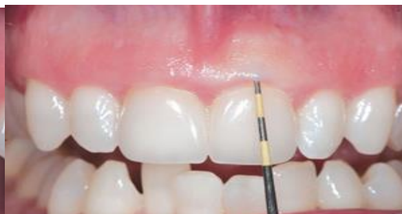
FIGURE 3: THICK PHENOTYPE