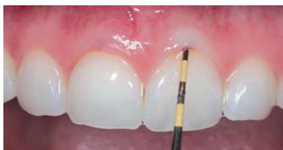
FIGURE 2: THIN PHENOTYPE