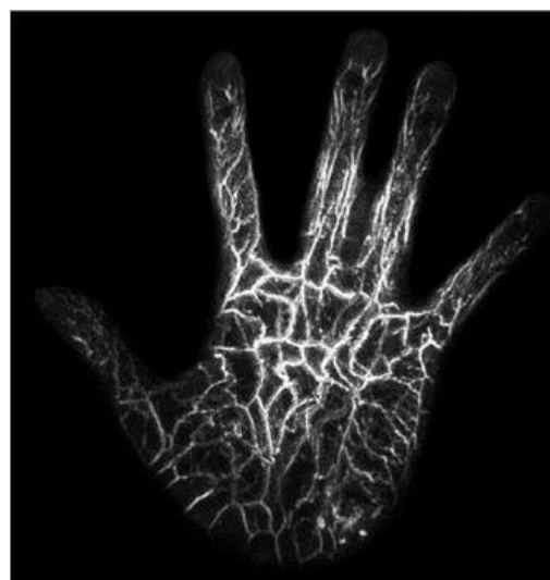
Figure 2: In vivo PACT image of a human hand, showing its comprehensive vasculature. [23]

One of the promising developments in photoacoustic imaging is the integration of PAT with other imaging modalities, such as Magnetic Resonance Imaging (MRI), Computed Tomography (CT), and Ultrasound. Combining PAT with these modalities can provide complementary information, enhancing diagnostic accuracy and enabling more comprehensive imaging.[17] For instance, MRI provides excellent soft tissue contrast and anatomical details, while PAT can add functional information such as blood oxygenation and vascularization. The integration of these modalities can offer a more complete picture of the underlying pathology, particularly in complex diseases like cancer.[18] Similarly, the combination of PAT with CT, which provides high-resolution images of bone and dense tissues, allows for precise localization of tumors and other abnormalities in relation.