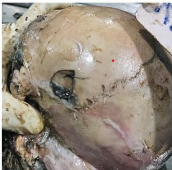
Figure 2: Showing the blunt force trauma injury in the left frontal region of cranial vault