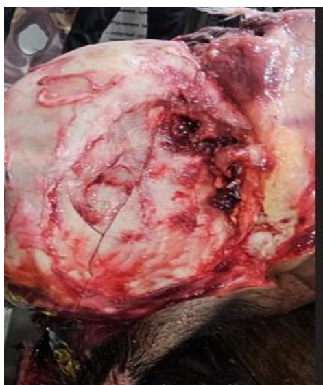
Figure 3: Showing the blunt force trauma injury in the right parietal region of cranial vault