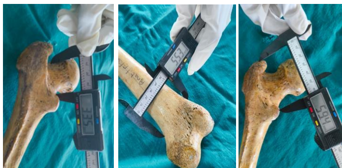
Figure 2: The parameters length of femur neck, diameter of femur shaft at distal end and distance between tip of greater trochanter to tip of lesser trochanter of femur.

The measurement with respect to the femur length is given in table 4. The measurements of upper and lower end of femur is given in table 5 and table 6 respectively. All the measurements are expressed in millimetres (mm).