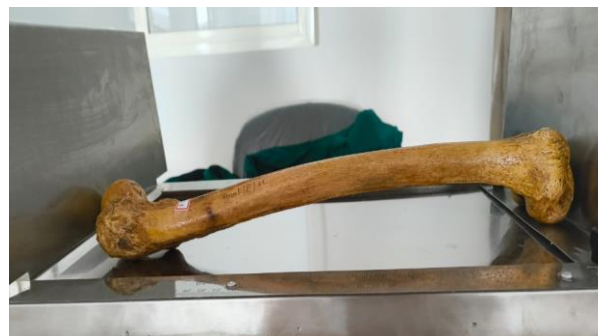
Figure 1: Parameters measured by taking vertical length of the femur and the osteometric board used in the measurement of femur length