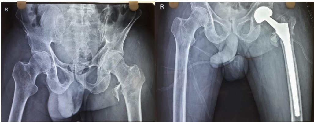
Preoperative and Postoperative X-Ray POD-1