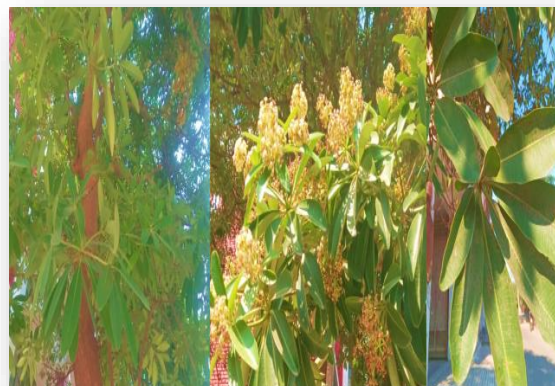
Figure 2. A. Scholaris tree leaves and flower