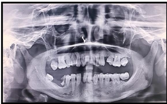
Fig: 4 (Panoramic Radiograph)

Radiographic Examination: Refer figure- 3 & 4