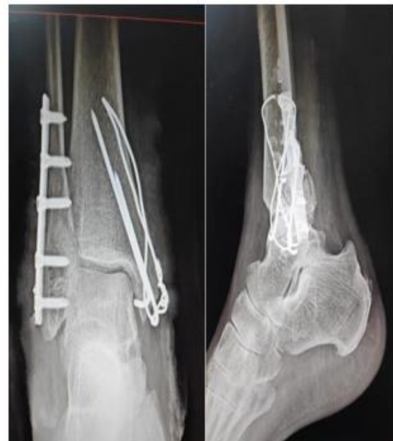
Fig. 2: Radiological outcome of a representative case achieving excellent functional outcome