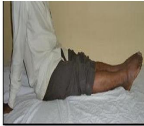
PLANTARFLEXION OF ANKLE