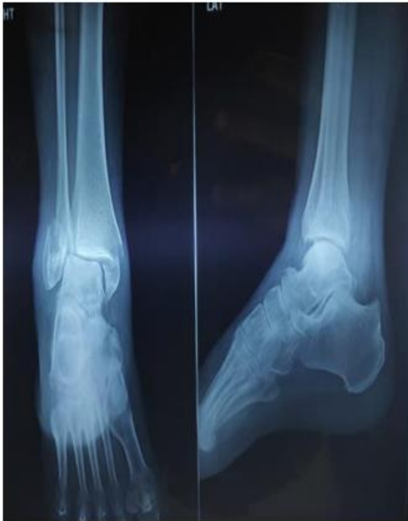
PRE-OPERATIVE X RAY