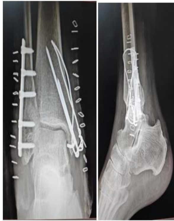
POST-OPERATIVE X RAY