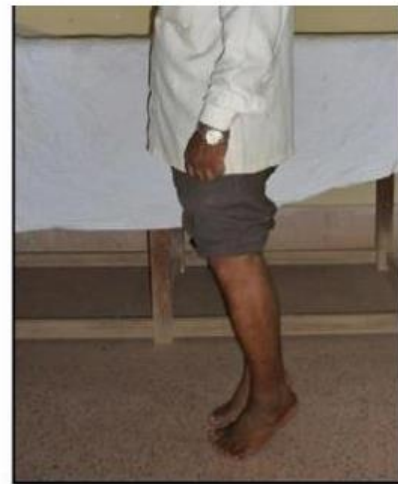
STANDING ON TOETIPS