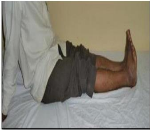
DORSIFLEXION OF ANKLE