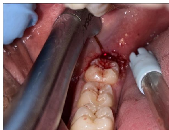
Figure 1 - Operculectomy using Er,Cr:YSGG laser

and antibiotic usage, were examined using the chi-square test. Continuous variables, including VAS pain scores, were analyzed using either independent t-tests or Mann-Whitney U tests, depending on the data distribution. A p-value below 0.05 was regarded as statistically significant.