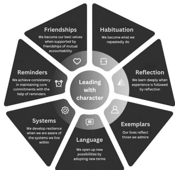
Figure 2 Seven Strategies for Character Development, based on Lamb et al. (2022)

Defined as a forward-looking intention to achieve goals meaningful to oneself and beneficial to the common good (Damon et al., 2003), purpose connects personal values with broader societal needs. It provides clarity, motivation, and resilience, empowering leaders to inspire others and address challenges with integrity and vision. Research has shown that purpose enhances