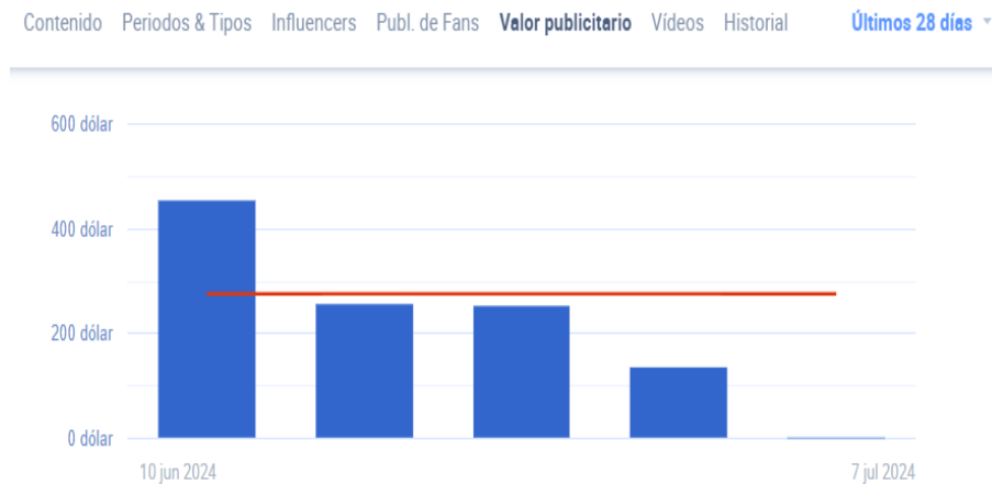
Figure 2. Advertising value

In relation to the weekly advertising value of the publications this page has reached a certain number of people.