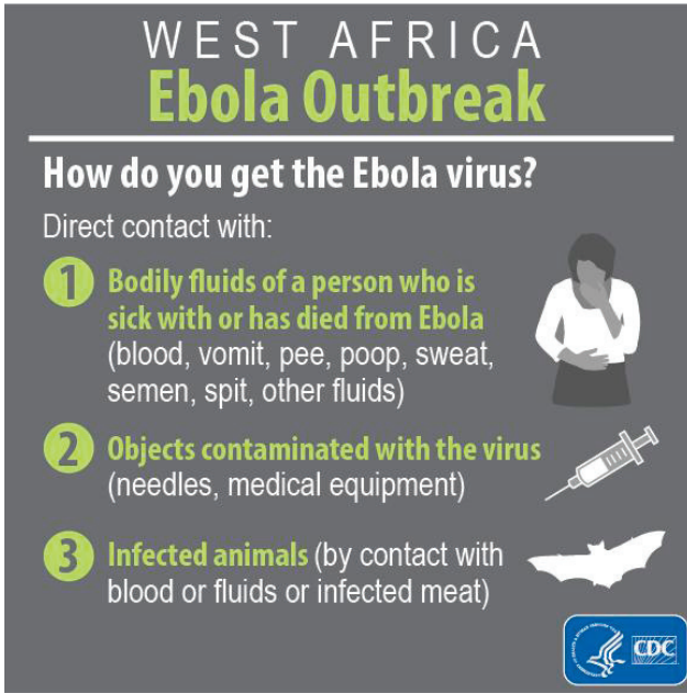
FIGURE 1 Positive explanation exemplar.

(see Figure 1). No exemplars were identified in the tweets that focused on action steps. Ultimately, a majority (88%) of the live chat tweets emphasized explanations of the situation and events, and fewer than 1% offered exemplars.