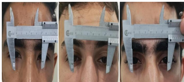
Figure 3: IPD measurement