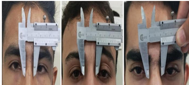
Figure 1: ICD measurement

left maxillary canines were marked on blackened soot. The caliper was employed to measure the distance between markings of maxillary canine tips made on horizontal arm (Fig. 4).