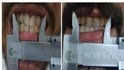
Figure 4: ICaD measurement

Variations in landmark selection among observers were minimized by using a consensus of three observers, and differences in measurements were reduced by having a single person record all