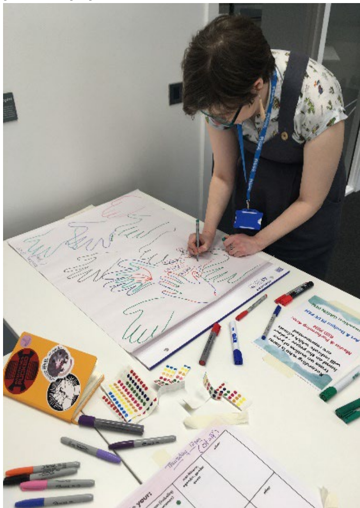
Figure 1. Attendance recording, one of the authors draws around her hand on a piece of paper.

Our arts-led workshop was straightforward. We took a deliberately small approach, to leave space for the conversations to take place. We invited staff, and a mix of undergraduate and taught masters students to participate (nobody was coerced into attending, unless the promise of biscuits counts). Student and staff workshops were run separately, but the content and approach taken was the same. Our first step was for workshop participants to get comfortable with drawing: we asked each of them to record their attendance semi-anonymously, by drawing an outline of their hand on a shared sheet of paper, with the pen colour corresponding to their subject area (see Figure 1). This generated initial engagement with material thinking and represented an individual arrival into the artistic and reflective space (MacLellan, 2017, Bolt, 2019)