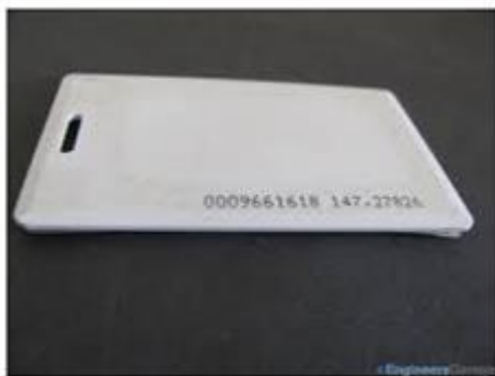
Fig: RFID tag

RFID Tags The Tag is made up of an antenna and a microchip that stores the identification data. The transceiver, also known as a tag reader, and the tag are able to communicate using radio waves. Radio frequencies carry the identifying information. Active and passive tags are the two main categories. Because the Reader's electromagnetic energy is what powers the passive tags in this application, they are called electromagnetic induction tags. These are inexpensive and often used, as seen in Figure