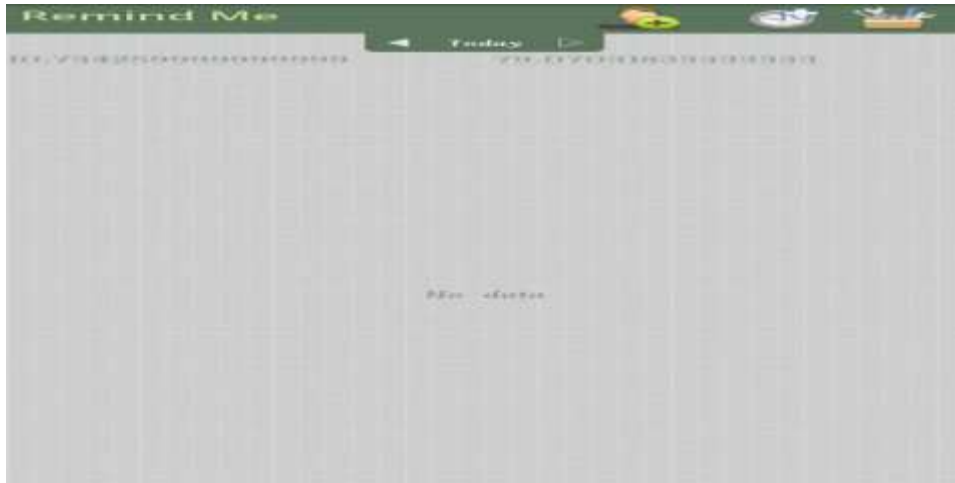
Fig. 2. App homepage

The app's homepage, as shown in Fig. 2, acts as users' main center and provides access to important features and functionalities as well as simple navigation. The homepage, which was created with the user in mind, has a simple, uncluttered design that makes it easier for people with vision impairments to navigate.