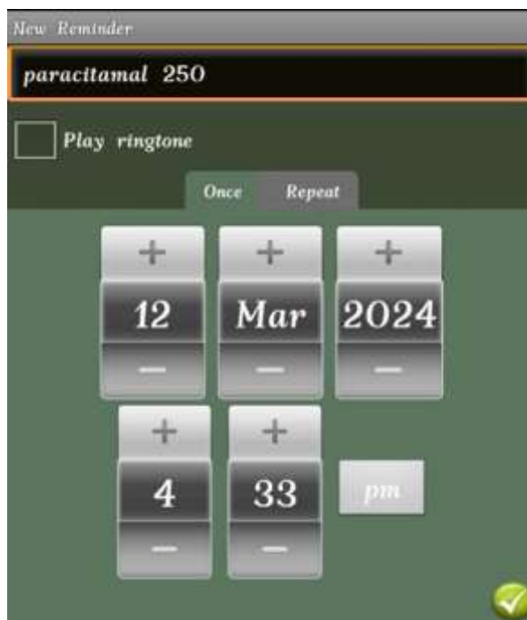
Fig. 3. Reminder setup

The app's homepage, as shown in Fig. 2, acts as users' main center and provides access to important features and functionalities as well as simple navigation. The homepage, which was created with the user in mind, has a simple, uncluttered design that makes it easier for people with vision impairments to navigate.