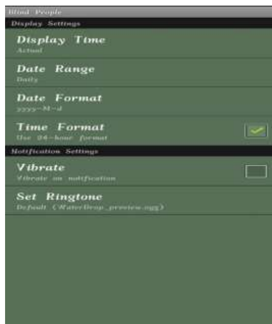
Fig. 4. Working Setup

Fig. 4 shows the working setup screen and the settings that may be configured for the user's workstation or preferred environment using this application. With the use of this interface, visually impaired users can easily customize their app settings to meet their unique requirements and preferences while working.