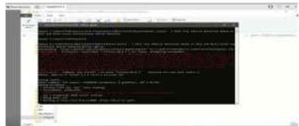
Fig 3 Anaconda Prompt

The dataset is specifically curate for smart city applications, focusing on parking occupancy detection using a modified YOLO-v5 architecture. Captured through a cenital-plane camera positioned at a high distance, allowing comprehensive monitoring of entire parking spaces or large parking areas with a single camera. The dataset emphasizes diversity in parking scenarios, encompassing different lighting conditions, vehicle sizes, and parking space layouts.