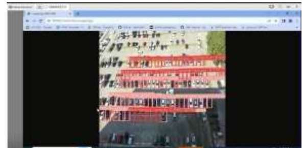
Fig 10 Result