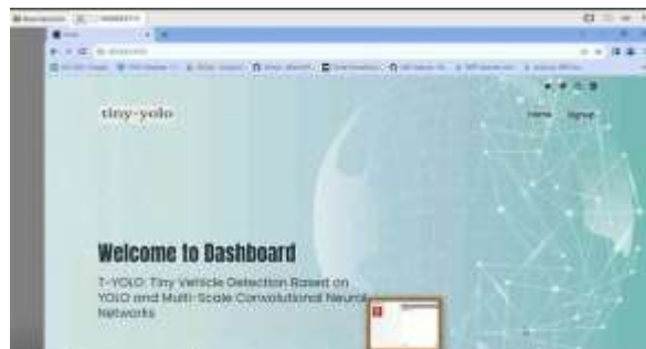
Fig 4 Home Page