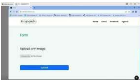
Fig 8 Upload any images