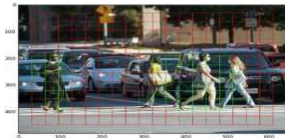
Fig 2 Input Images

First, the image is divided into various grids. Each grid has a dimension of S \times S . The following image shows how an input image is divided into grids.