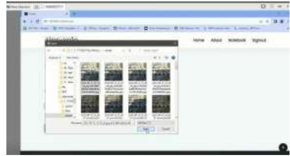
Fig 9 Random selection of images