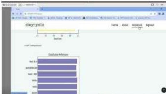
Fig 7 Classification Performance