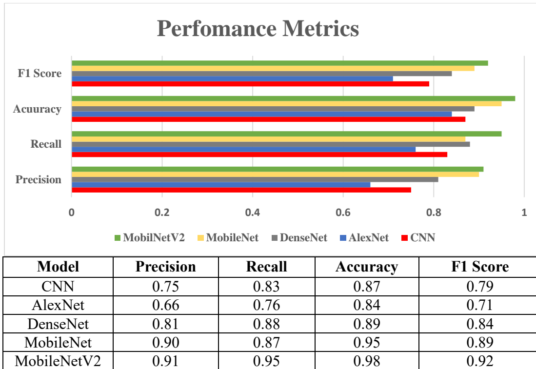
Figure 3. Performance Metrics of the Models

MobileNetV2 based animal detection model experimental research shows that it provides the high accuracy for the real-time animal detection. The models are trained on an animal image dataset and used data augmentation techniques like rotation, width/height shifts and horizontal flip to increase the variability of the training data. This helps the model to generalize better and reduces the overfitting of the data. MobileNetV2 reduces the computational time and improves the accuracy when the model starts with knowledge from a large dataset like ImageNet. MobileNetV2 is fine-tuned by setting the 100 layers free which allows the model to learn specific features of the animals. The model is trained with the 10 epochs with frozen and fine-tuned layers and it helps to converge to identify the specific animal with 98.67% training accuracy and 86.70% validation accuracy, where the model does an incredibly well on training data and testing data stand with 97.8% accuracy. Additionally, a batch size of 32 with smaller learning rates during the model helps in smooth convergence without drastic changes in weights, which ensures in stable trainings and performances of models.