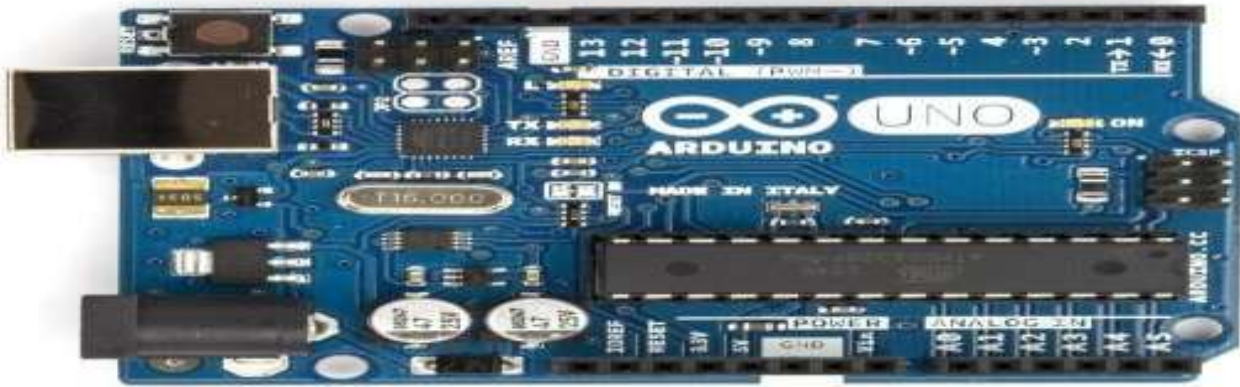
Fig 3: Aurdino UNO

MHz ceramic resonator, 6 analog inputs, 14 digital input/output pins (six of which can be used as PWM outputs), a USB port, a power jack, an ICSP header, and a reset button. It comes with everything required to support the microcontroller; all you need to do is power it with a battery or an AC-to-DC adapter or connect it to a computer via a USB cable to get going.