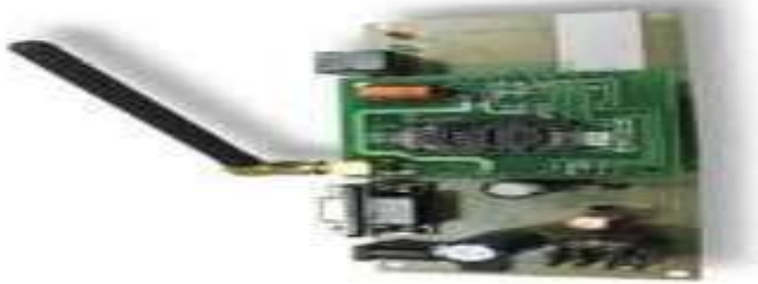
Fig 5: GSM

Global system for mobile communication, or GSM, is a type of mobile communication modem. At Bell Laboratories, the GSM concept was invented in 1970. It's a mobile communication system that's commonly used worldwide. GSM uses the 850MHz, 900MHz, 1800MHz, and 1900MHz frequency bands to provide mobile voice and data services. It is an open, digital cellular technology.