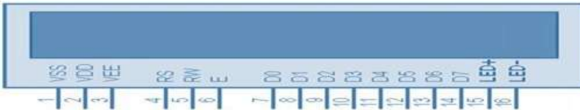
Fig 4: Pin Diagram of LCD

Liquid Crystal Display, or LCD for short, is a very useful tool for debugging and providing user interface. Character-based LCDs based on Hitachi's HD44780 controller or other HD44580-compatible models are the most often used type. Today's most often used LCDs are 1 Line, 2 Line, and 4 Line LCDs, which each contain a single controller and can support up to 80 characters; LCDs that support more than 80 characters require two HD44780 controllers.