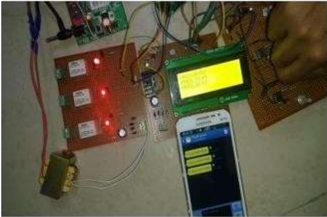
Fig 6: Experimental results