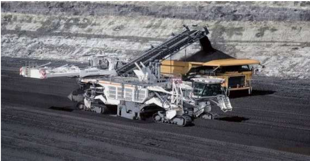
Figure 3. Highwall Miner Layout