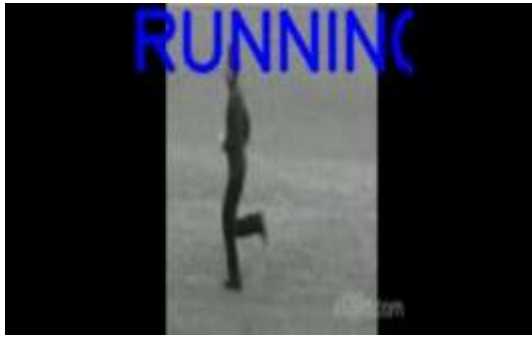
Figure 6. Labelled Output Video (Running)