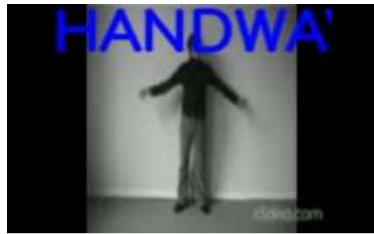
Figure 7. Labelled Output Video (Handwaving)