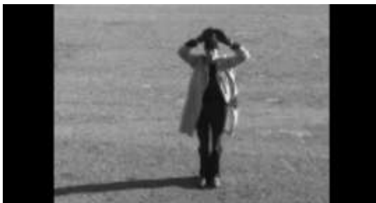
Figure 4. Input Video (Handwaving)