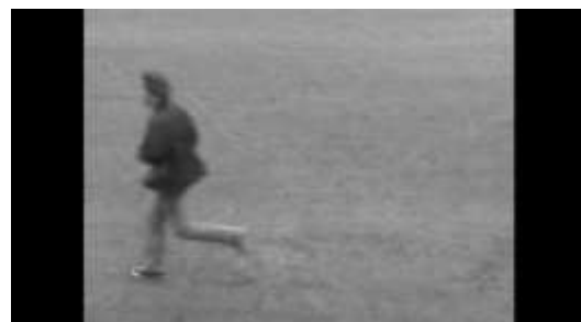
Figure 5. Input Video (Running)