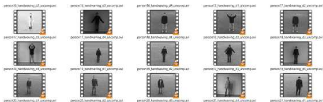
Figure 1. Hand Waving Sample vide

amazing arrangement of profound learning. Those techniques can improve human-PC connection. Each activity performs by people and mix of activity work in movement. Perceive singular activity perform action. So it is a huge theme of subclass variety of HAR.