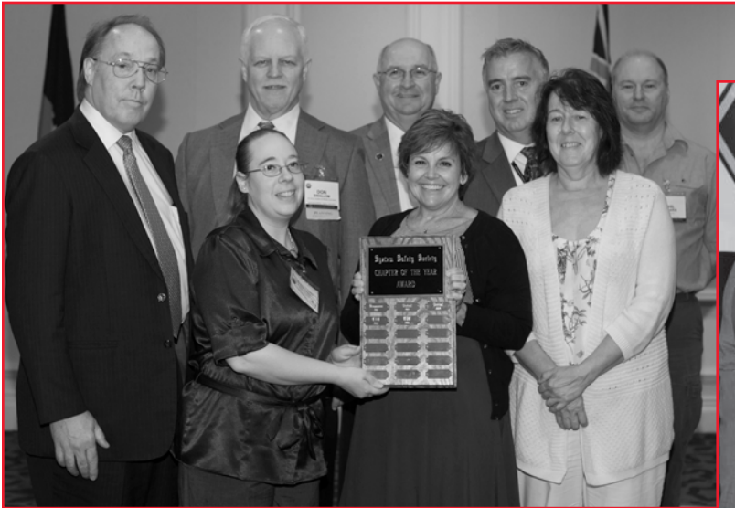
Tennessee Valley Chapter