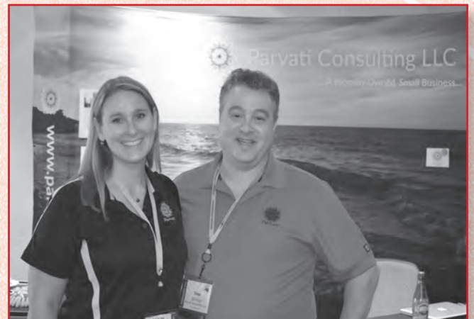
Many thanks to ISSC36 Sponsor Parvati Consulting for their expertise in Hazard Analysis and application of LOPA.