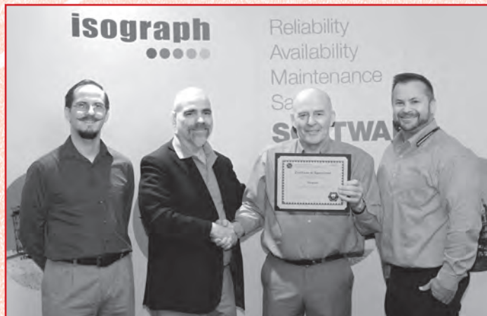
The ISSS gives its deepest appreciation to ISSC36 Sponsor Isograph, who provided expert training of their FTA software tool.