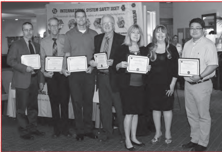
The Washington DC Chapter came out in full force with their knowledge and expertise. Discussing issues of mutual interest is a primary goal of the Conference.