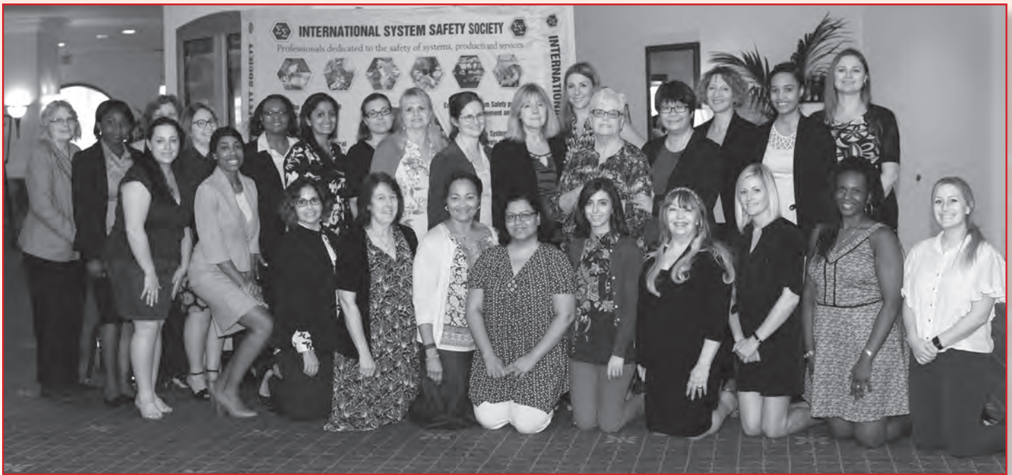
Bright Future of SSE — The future of System Safety Engineering is bright when everyone has an equal voice.