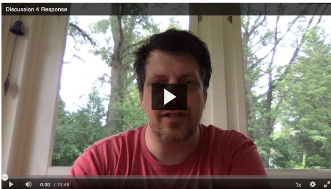
Figure 4. Video response example. Videos posted in the Canvas Announcements area provide students with a summative response to discussions.

I really enjoyed your posts about The Mask You Live In in Discussion 4 ! If you haven't already, please go back into the discussion and see what your classmates wrote in response to your initial posts. I have also provided some thoughts in the discussion and in my short video response to Discussion 4 .