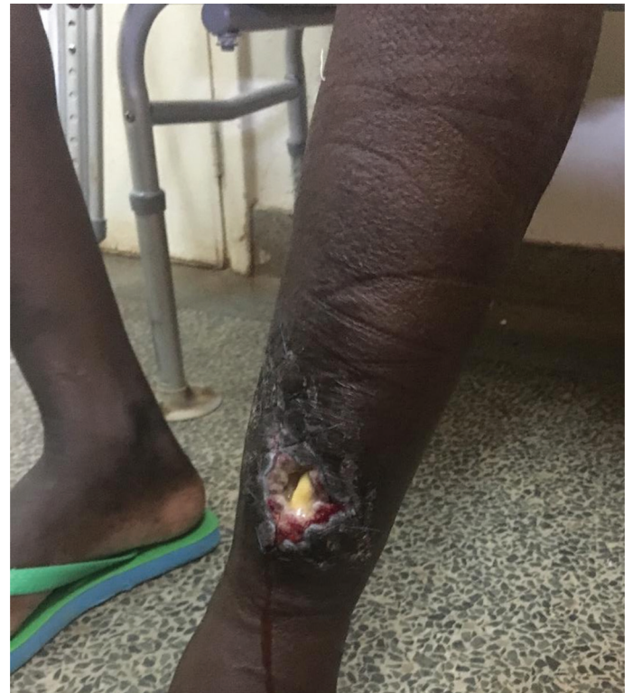
Figure 5. Clinical image of a patient with chronic osteomyelitis with draining sinus.

The approach for managing chronic osteomyelitis can be controversial, but principles are the same: remove necrotic and devascularized tissues, manage soft tissue dead space, confer stability, and treat infection. 19 However, there are multiple methods of achieving this from temporary antibiotic coated nails and soft tissue