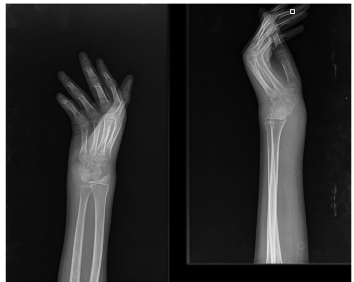
Figure 3. Radiograph of chronic extrapulmonary tuberculosis of the wrist in a 13-year-old boy confirmed with PCR testing.

The effects of chronic osteomyelitis are far-reaching. Beyond the pain and discomfort associated with pathologic fractures and chronic draining sinuses (Figure 5), many patients are also limited in their educational and vocational opportunities. Because many secondary schools are boarding schools in Kenya, a student may be refused admittance if they have a chronic draining sinus as it is a sanitary and hygiene concern.