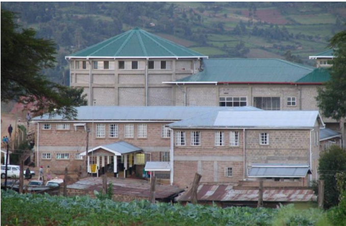
Figure 1. Tenwek Hospital is a 300+ bed mission hospital in Bomet, Kenya.