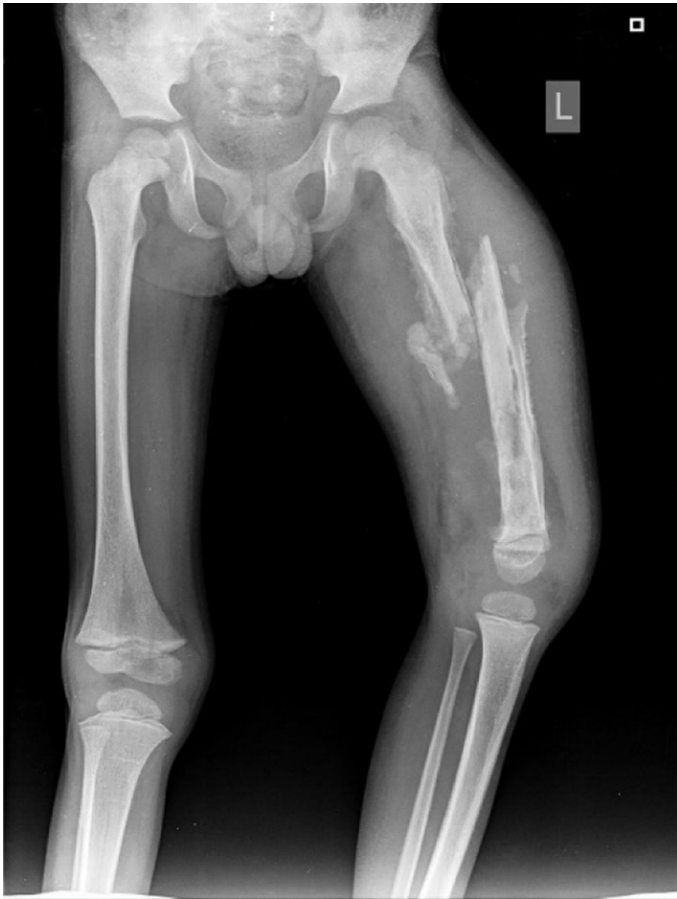
Figure 4. Radiograph of a 5-year-old boy with pathologic fracture of his left femur chronic osteomyelitis.

Furthermore, in the case of fracture or stiffness from chronic infection, some secondary schools may not be able to accommodate the disability. For many in Kenya, manual labor is a primary form of employment. Thus, children with sequelae of chronic osteomyelitis are often excluded from these employment opportunities when they reach of age. However, non-manual labor often requires more formal education as a job requirement. Thus, unable to perform manual labor and unable to acquire the formal education required for non-manual labor, patients with chronic draining osteomyelitis are often at a loss.